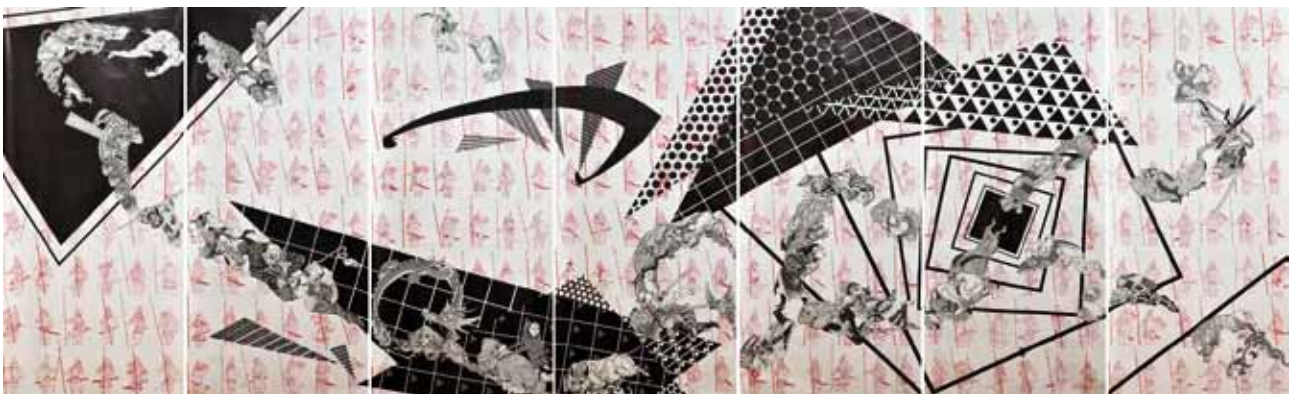
Ziellose Reise, 2014, Filzstift auf Papier, 16-teilig, 200x720 cm | Eindringling aus der Vergangenheit, 2014, Filzstift auf Papier, 7-teilig, 200x642 cm Aimless journey, 2014, marker on paper, 16 parts, 200x720 cm | Intruder of the past, 2014, marker on paper, 7 parts, 200x642 cm