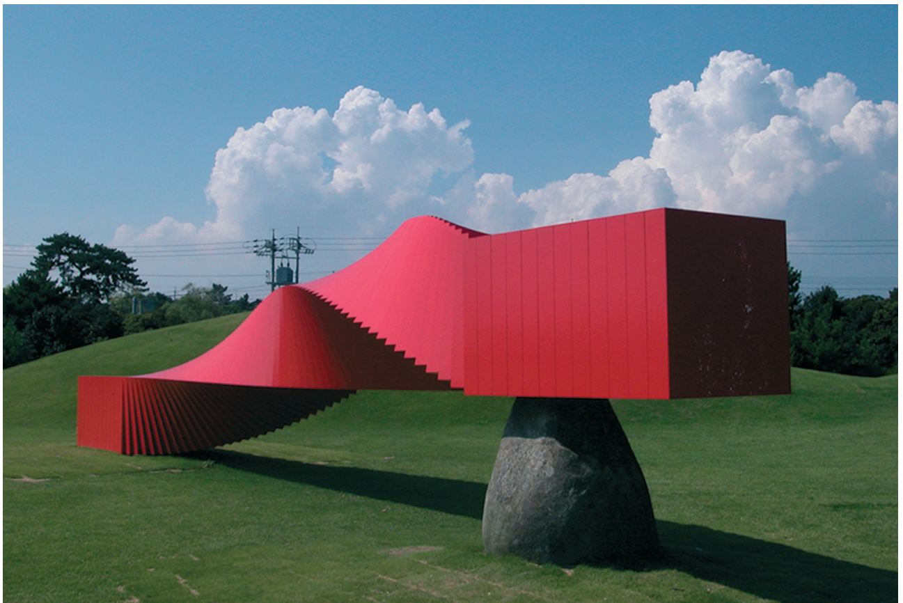
Locus of Time 17-2, 2017, Stahl, bemalt, Felsblock, 140 x 4200 x 1600 cm Locus of Time 17-2, stainless steel, painted, boulder, 140 x 4200 x 1600 cm

Born 1945 in Yamaguchi, Japan. 1966–1972 Studied Sculpture, Aichi Prefectural University of the Arts, Japan. Numerous exhibitions and awards, sculptures in public spaces and in public collections. Selected int. Sculpture Symposia: Lindabrunn (1973, AT), Suwako (Art Director, 1978, JP), Hagi (Art Director, 1981, JP), East-West Forum (1983, NL), Forma Viva (1983, HR), Park-Hills-Tawara (organizer, 1990, JP), Aio (organizer, 1992, JP), Muraoka (organizer, 1992, JP), The Third China (2004, CN). Selected public art competitions: Hsintien Station (1999, TW), Panchiao Station (2000, TW), China Oil Ltd. (2001, TW), Kaohsiung South Post Office (2002, TW), Museum of Hakka (2002, TW), Kajima International Sculpture (2006, JP), Taiwan Army School (2008, TW). Selected exhibitions: Ube Biennale (1973/75/77/91, 2001/03/09, JP), Tokyo Biennale (1974, JP), Contemporary Art Exhibition of Japan (1975/76), Chelsea harbour Sculpture 93 (UK), Sculpture by the Sea Bondi, Sydney (2012–2016), Sculpture by the Sea Cottesloe, Perth (2016/17 AU). www.t-m-tanabe.jp/takeshi/works.html